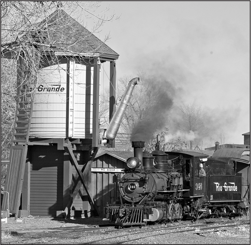
Locomotive 346 passes the newly rebuilt “Headington” water tank at the CRRM during the Santa steam-up on December 13, 2008.