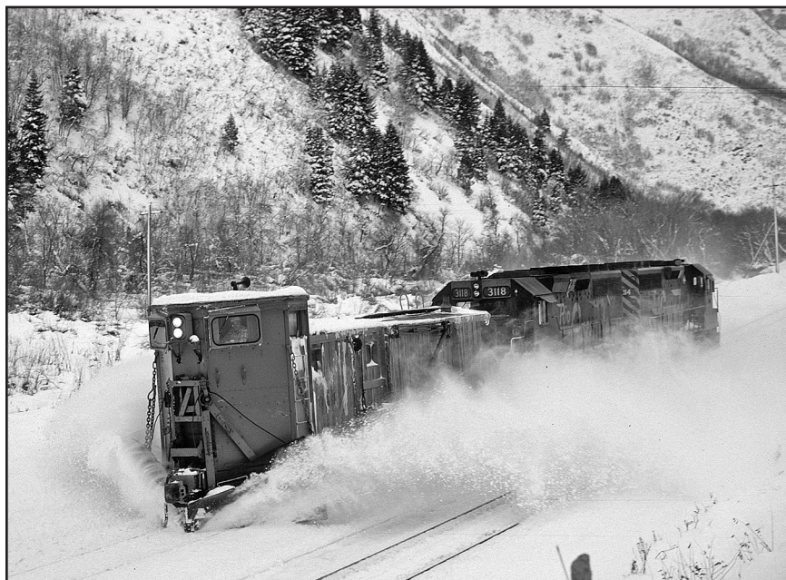
Clearing the line on Soldier Summit in Utah.