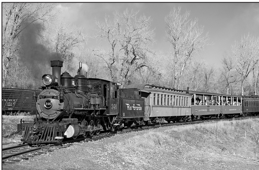
Locomotive 346 and four cars full of visitors to the Santa steam-up on December 13, 2008.