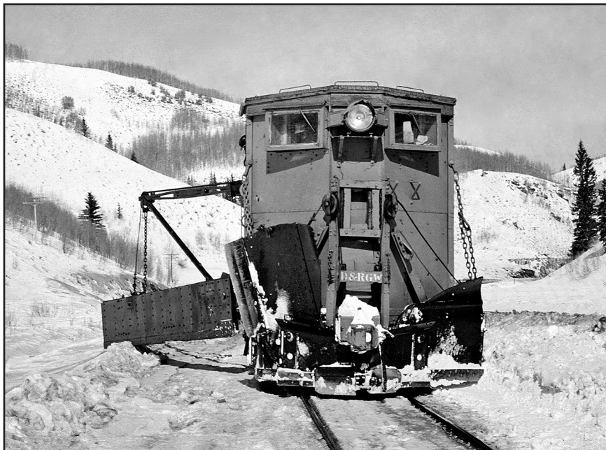
Snow fighting equipment on the Pleasant Valley Branch in Utah.