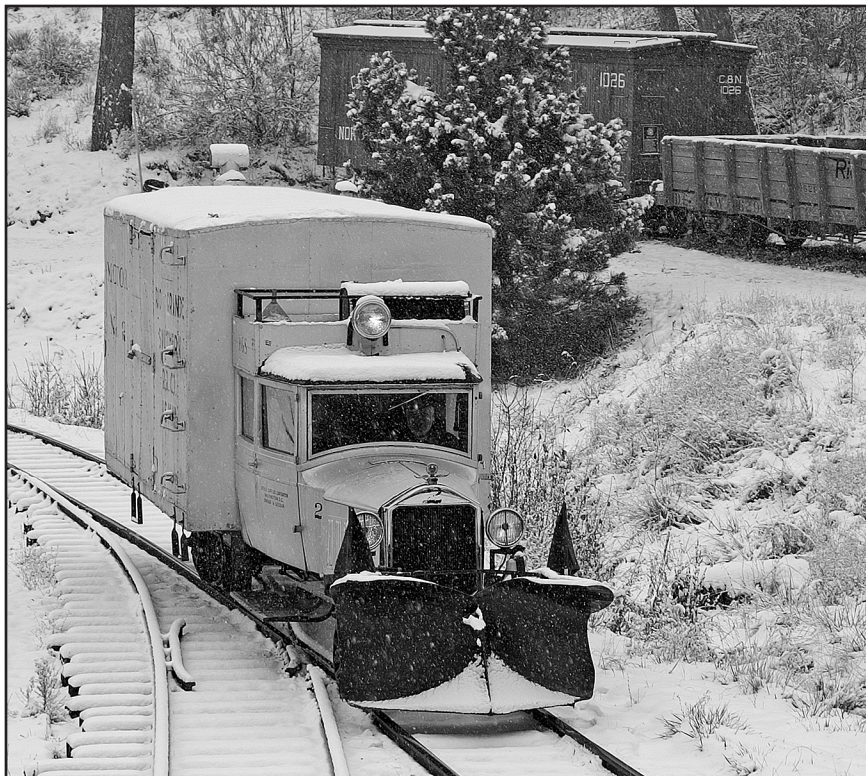
RGS motor #2 in a snowy scene at the CRRM Goose Fest.