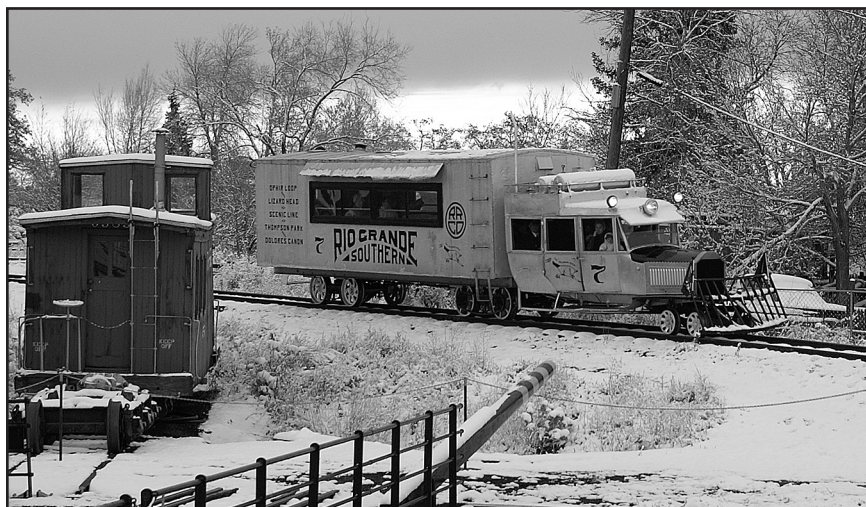
Just before sundown on November 30, 2008, RGS motor #7 takes the last group of passengers around the loop at the CRRM. – Two photos © 2008 Dave SchAAF.